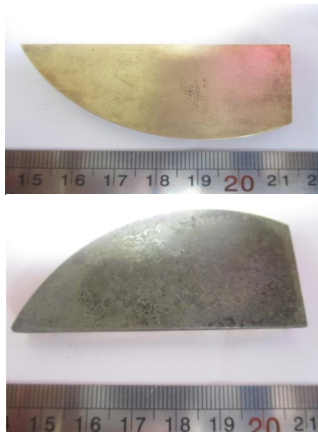
(a) before wear test (b) after wear test

The wear resistance was tested by abrasive disk with a hardness of at least 2060 HV under a stress of 7.9 MPa (applied force to the 150 N) at a linear speed of 10 m/min. The surface area of the sample is 18.92 mm 2 (Fig. 3a). After a distance of 22 m, the bronze was completely (100%) removed (Fig. 3b) by 40.1 mm 3 , and the test was stopped. It should be noted that no lubrication has been used.