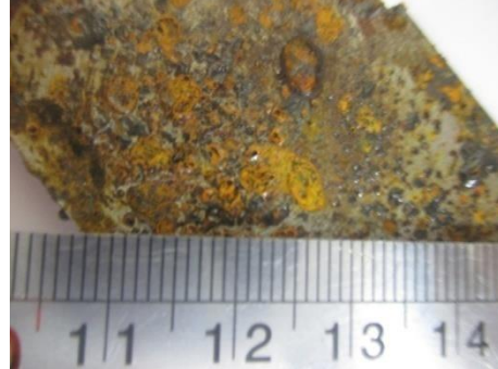
Figure 2: Sample image after 168 hours of corrosion

Corrosion test by salt spraying at a concentration of 5 \pm 1\% by weight of salt and distilled water and with acidity of 6.5 to 7.2 at 35°C and with salt spraying pressure from 0.83 to 1.24 bar, so that the angle of 15 to 30 degrees relative to the vertical direction in the enclosure is suspended for 168 hours. The volume of the collected solution is 1 to 2 liters per hour and the sample was washed with raw water. The initial weight of the sample was 89.24 g and the sample weight after the end of the test was 88.47 g (Fig. 2). In this way, weight loss is 0.86%.